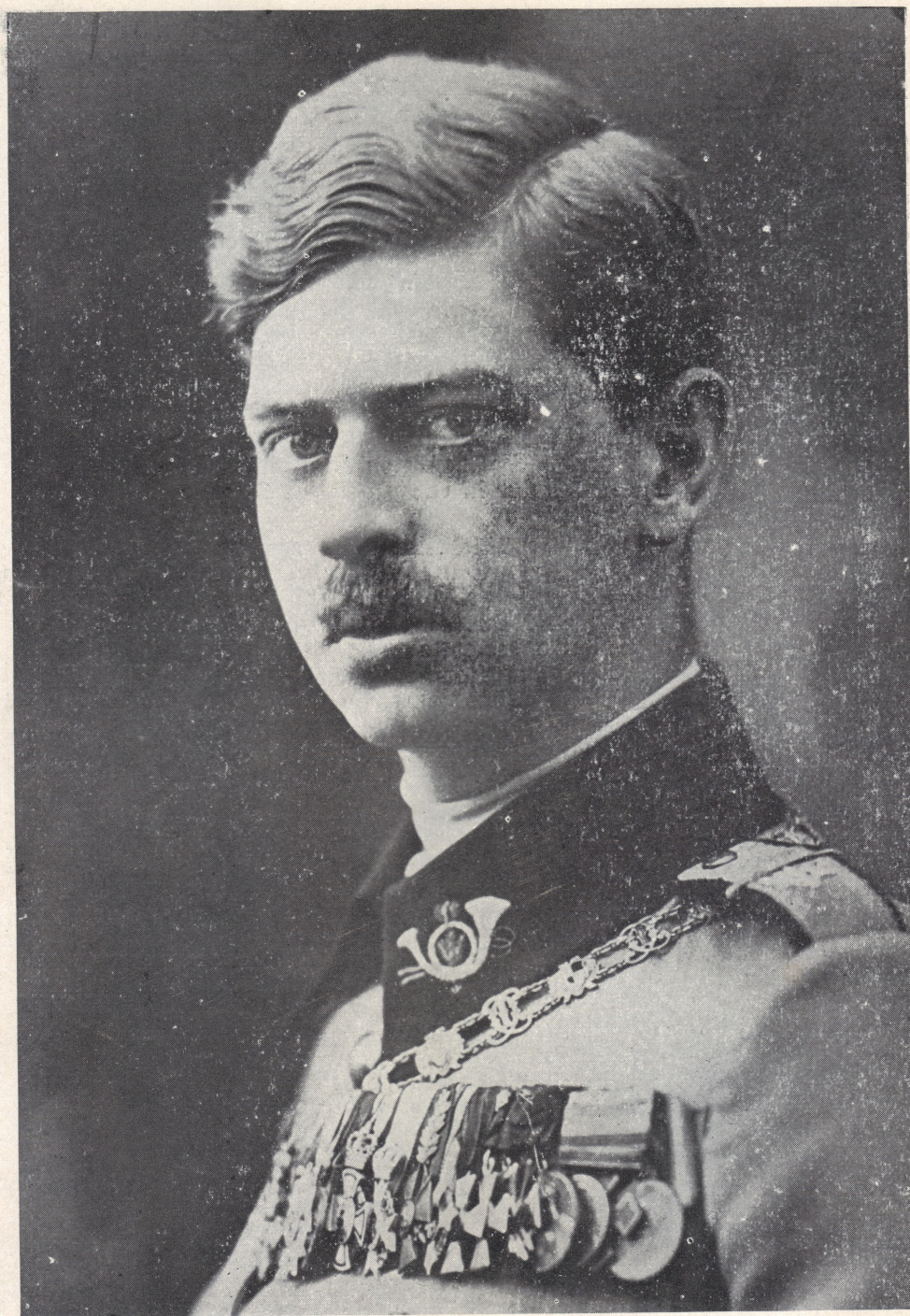
Soc. Friends of Roumania KING CAROL of ROUMANIA